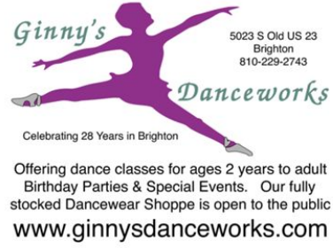
HALF PAGE TEMPLATE 4.5" x 3.75"